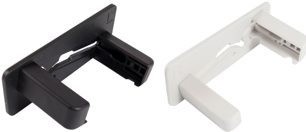
Bracket holder (exemplary illustrations)

Mounting solution for TWN3 and TWN4 MultiTech desktop readers